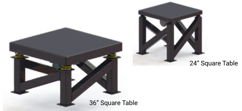
36" Square Table