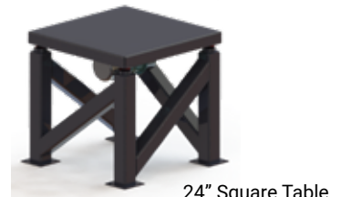
24" Square Table